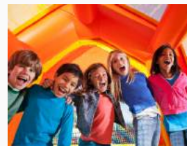
Structured Practical Tasks