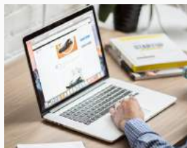
Online Local Formation Groups