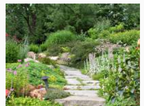
Three one-day gathered retreats

On successful completion of The Deepening Discipleship Project and your Safeguarding Training you will be eligible to be authorised in a Celebration of Lay Ministries Service.