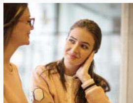
Mentoring in Context

10 months Space to explore your calling and gifts