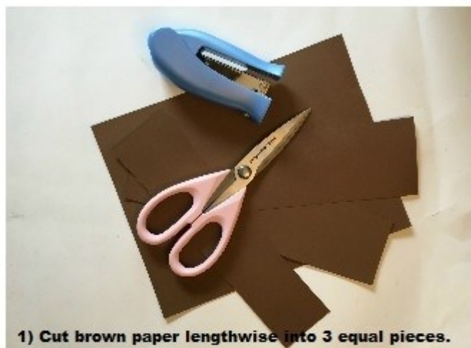
1) Cut brown paper lengthwise into 3 equal pieces.