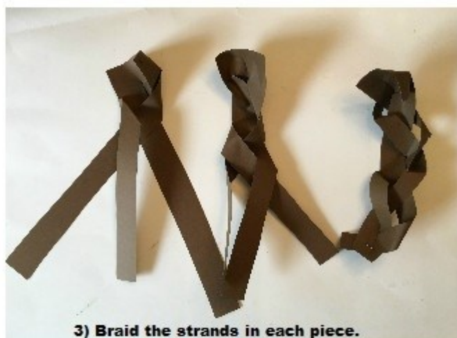
3) Braid the strands in each piece.