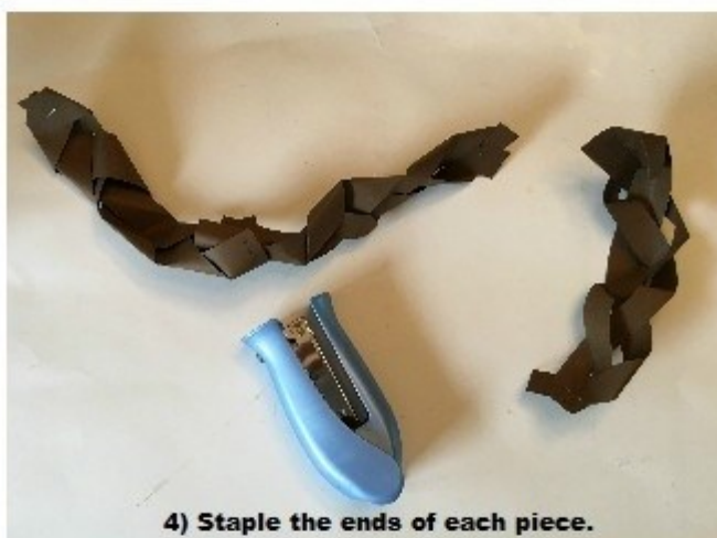
4) Staple the ends of each piece.