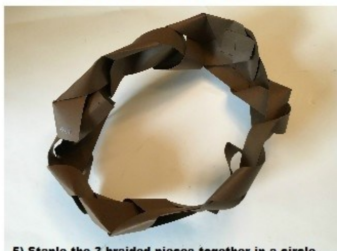
5) Staple the 3 braided pieces together in a circle.