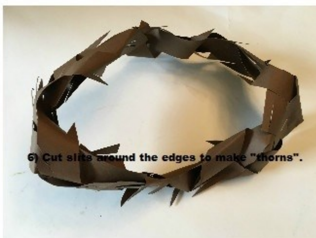
6) Cut slits around the edges to make "thorns".