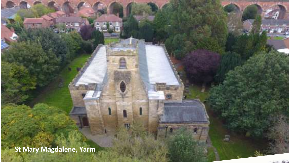
St Mary Magdalene, Yarm