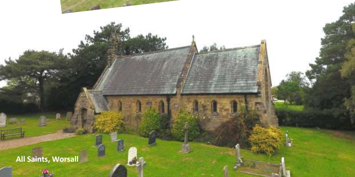
All Saints, Worsall