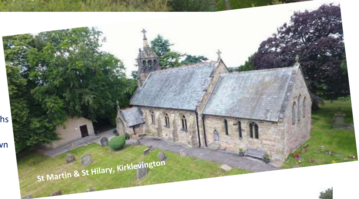
St Martin & St Hilary, Kirklevington