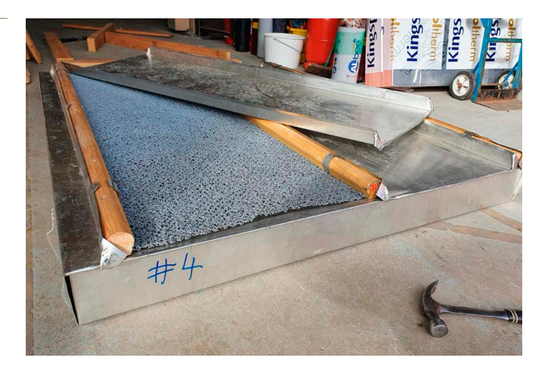
Figure 8: Spiral mesh underlay under test

Suggest an acoustic mat adhered to the underside of the flat pan of the roofing as quieter in heavy rainfall.