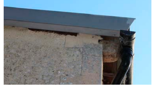
Figure 10: Straight verge fascia contrasts with uneven masonry