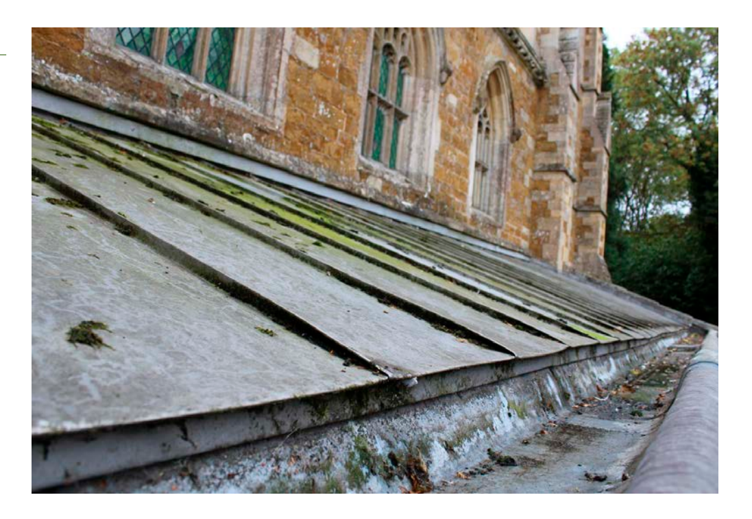
Figure 1: Standing seams