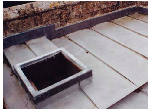
Figure 3: Awkward detail at verge with water running into upstand