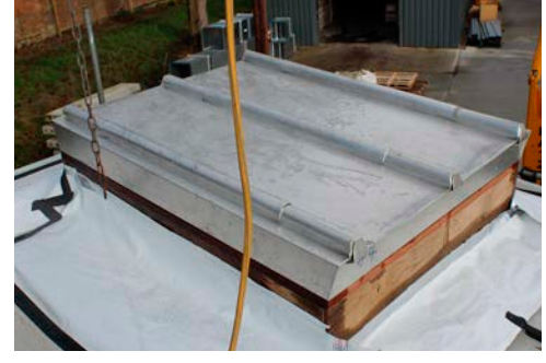
Figure 5: Standing-seam roof sample under test