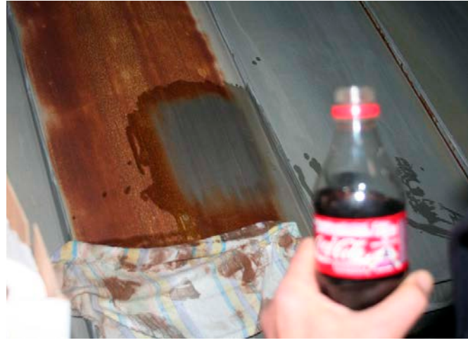
Figure 12: Discolouration of lead-rich terne-coated stainless steel