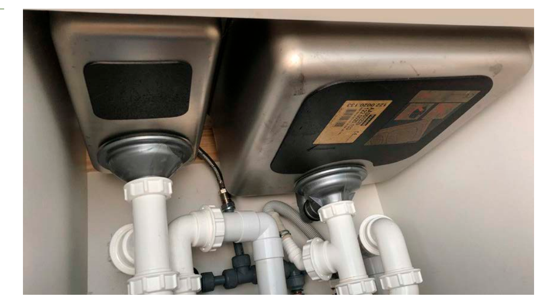
Figure 7: Mats bonded to underside of sink to reduce dripping noises

Independent tests carried out at the acoustic laboratory found that the addition of spiral-mesh open-fibre underlay reduced the sound intensity by 0.4 dB. The alternative solid acoustic mat reduced the sound intensity by 2.2 dB.