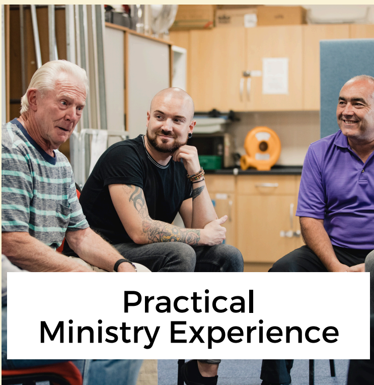
Practical Ministry Experience

The key focus of this course is supporting each individual in their unique ministry journey, enabling them to grow in confidence. Using reflective practice, we hope that you will be able to discover your strengths and find areas that you can develop. We encourage your context to be permission-giving and allow you to 'have a go'. This will hopefully give you the opportunity to explore what God is calling to you in a safe environment.