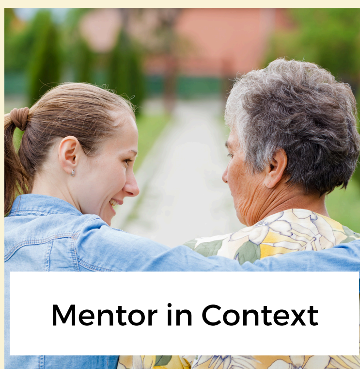
Mentor in Context

These days are based in different locations for different cohorts across the Diocese to ensure that we are offering local and accessible training.